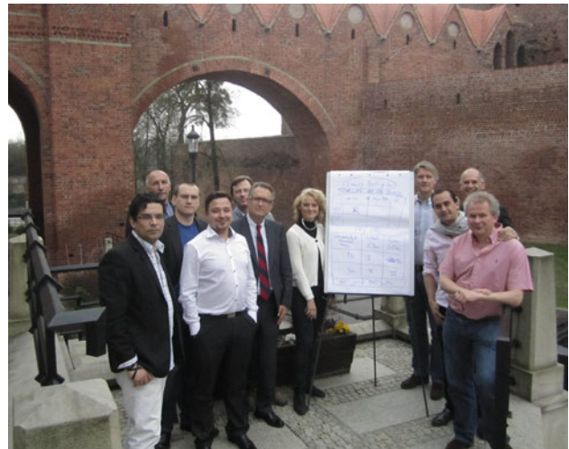
Fig. 1 The EHS classification for parastomal hernias is a proposal formulated during a consensus meeting in Toruń, Poland, on April 20–21, 2012

The participants agreed on the general rules of classification before their meeting. According to the ontology, unambiguous interpretation of the classes and strict